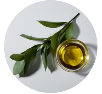
ORGANIC OLIVE OIL