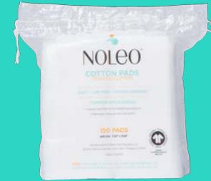
100% Organic Cotton Pads (150 Count )