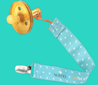
Pacifier & Toy Clip