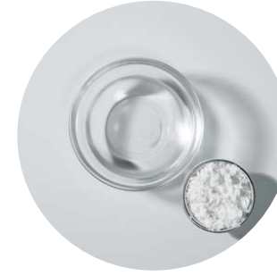
LIMEWATER CALCIUM HYDROXIDE + WATER