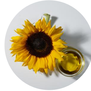
ORGANIC SUNFLOWER OIL