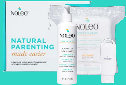
Babybox: 1 x Diaper Cleanser & Moisturizer + 1 x Bag Cotton Pads + 1 x Refill Bottle